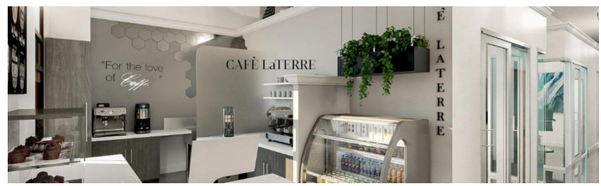
The Saturday Ride coffee stop