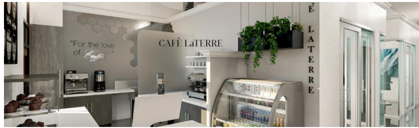
The Saturday Ride coffee stop