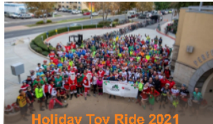
Holiday Toy Ride 2021