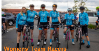
Womens' Team Racers