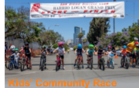
Kids' Community Race