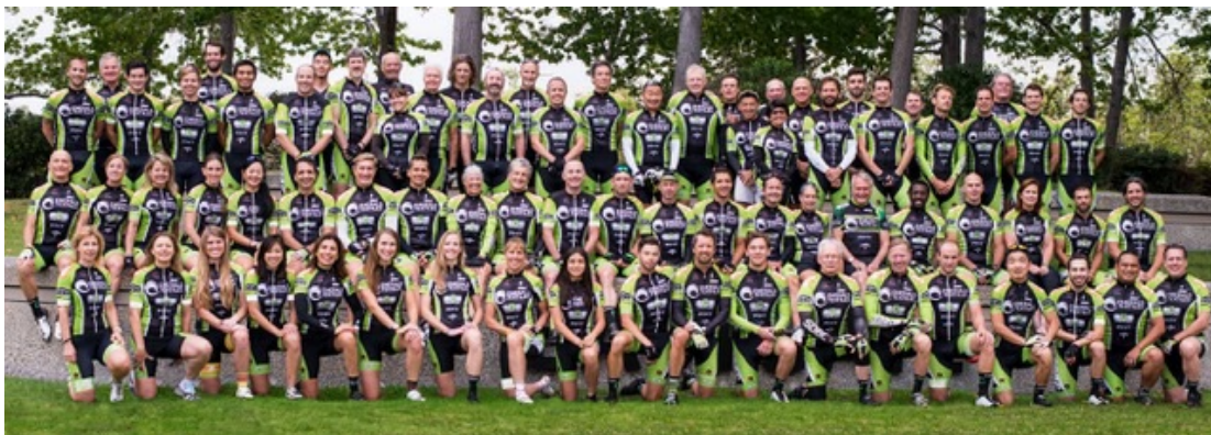
2015 Club Photo

NOTE: Our annual club photo will be taken just before the club rides. Please arrive early!!! 2023, 2022 kits and complete kits will be allowed in the first club photo. Club photo at 8:30 with Ride Leaders, Racers, and BoD ready at 8:15