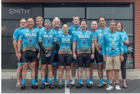
2023 Ride Leaders