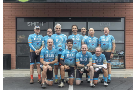
Board of Directors